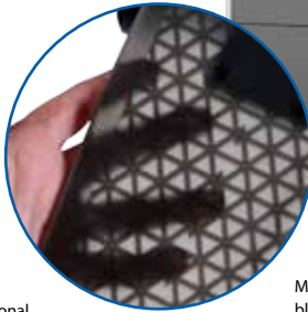
Multi-material prototypes can blend clear, black and white to communicate ideas and simulate finished products