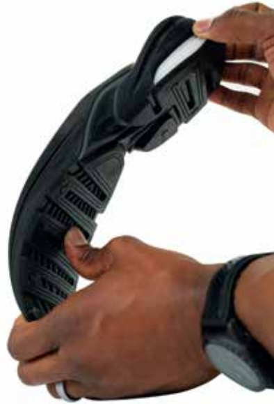
Shoe sole printed in a combination of flexible black elastomer and rigid white plastic

MJP offers exceptional resolution with layer thicknesses as low as 13 microns. Selectable print modes let you choose the best combination of resolution and print speed, so it's easy to find a combination that meets your needs. Parts have smooth finish and can achieve accuracies approaching SLA precision for many applications.