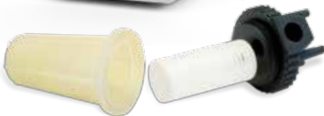
Functional filter prototype printed in clear, white and black rigid plastics

VisiJet M3 materials line delivers toughness, durability, stability, high temperature resistance, watertightness, biocompatibility and castability.