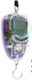
Print transparent, functional components and housings to see internal workings as assembled