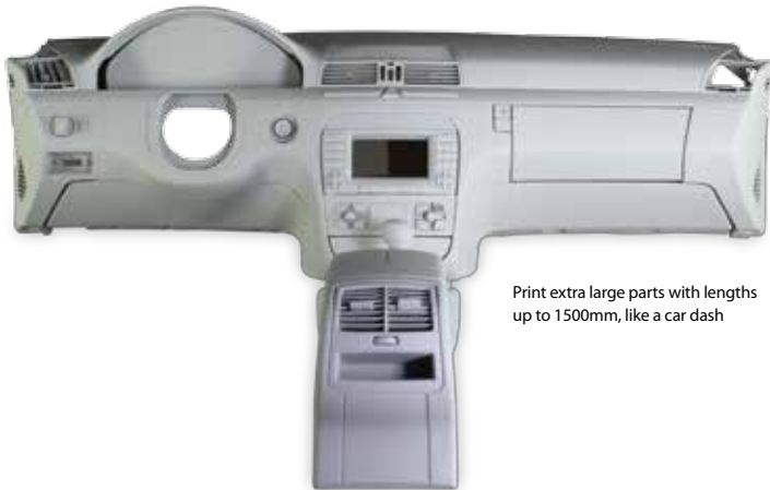
Print extra large parts with lengths up to 1500mm, like a car dash

3D Systems, the inventor of Stereolithography (SLA), brings you legendary precision in 3D printers, fine-tuned for cost-efficiency and unrivaled material availability. These advanced 3D printers produce exact plastic parts without the restrictions of CNC or injection molding. In addition to prototypes and end-use parts, these SLA printers create casting patterns, rapid tooling and fixtures. With speed, accuracy and surface quality of this level, you can produce low- to medium-run parts at a lower per-unit cost and build massive, highly-detailed pieces faster.