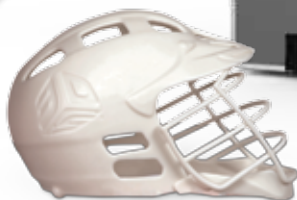
Helmet model printed in Accura Xtreme White 200