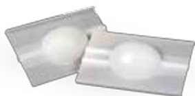
Microfluidic mixers printed in VisiJet SL Flex