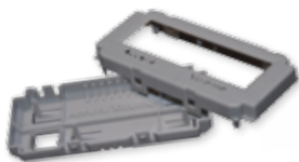
Electronic housing prototype printed in Accura Xtreme