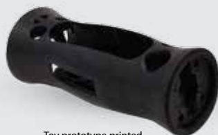
Toy prototype printed in Accura ABS Black

SLA printers are able to print highly detailed, tiny parts just a few mm in size, all the way up to 1.5 m long parts—all at the same exceptional resolution and accuracy. Even large parts remain highly accurate from end-to-end, with virtually no part shrink or warping.