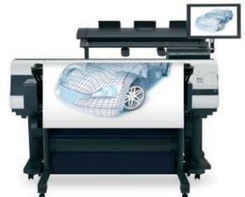
iPF850MFP / iPF850MFP Pro