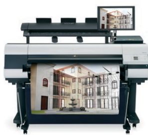
iPF830MFP / iPF830MFP Pro