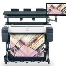
iPF785MFP / 785MFP Pro

Upgrade to the SmartWorks Plus software and gain additional features such as pdf/a file formats, multipage pdf scanning, auto cropping and more.