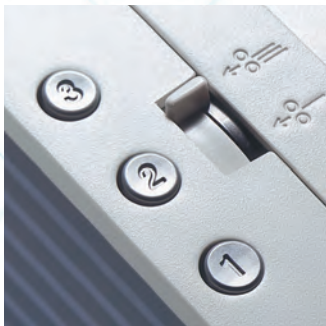
Scan-To-Job Buttons for One-Touch Operation

The DR-2580C scanner is not only one of the smallest and most versatile in its class, but it's also incredibly easy to use.