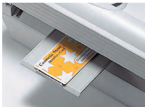
Straight Path for Card Scanning

The DR-2580C scanner also includes the Rapid Recovery System, which sends only completed image data to the application software, offering seamless scanning operation should a feeding error occur. And the Punch Hole Removal function removes the black dots that appear when scanning pages from booklets or binders.