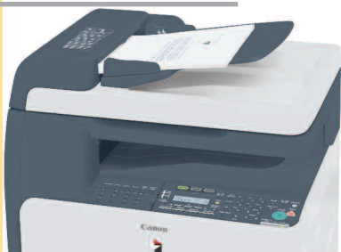
Duplexing Automatic Document Feeder