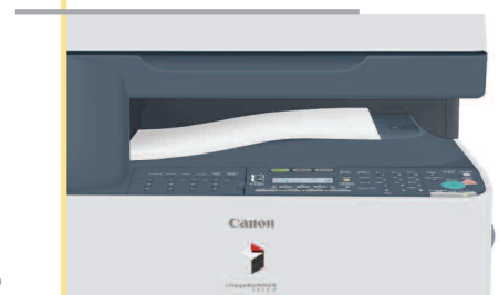
Integrated Output Tray

Plug-and-play connectivity is provided via a standard USB 2.0 Hi-Speed interface for optimal performance. Best of all, each model can be fully networked so you can extend system capabilities to multiple users (optional for the Canon imageRUNNER 1025 model).