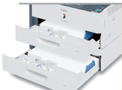
Expandable Paper Supply