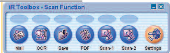
iR Toolbox Menu

The imageRUNNER 1025 Series models are easy to manage and maintain as well. The embedded Department ID Mode tracks and limits system access to those users assigned valid IDs and passwords. In addition, device management utilities, including a browser-based Remote User Interface (UI), provide real-time monitoring and status information, while high-yielding supplies and consumables help keep operating costs to a minimum. Even more, as an ENERGY STAR® qualified system, the imageRUNNER 1025 Series models are designed with the environment in mind.