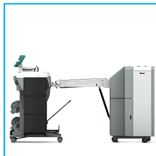
Ocè 4311 fullfold + Ocè ColorWave 300