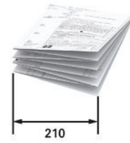
Standard folding packages