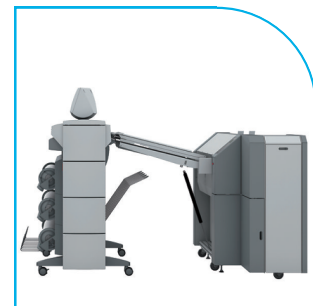
Ocè 4311 fullfold + Ocè TCS500

* The level of integration depends on the type of printer that the folder is connected to. For detailed information please contact your local sales representative.