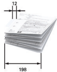
Standard folding packages with reinforcement stripe