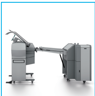
Ocè 4311 fullfold + Ocè ColorWave 550 & Ocè ColorWave 650