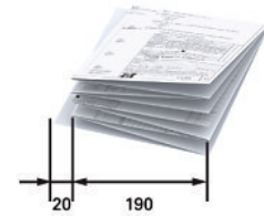
Standard folding packages with binding edge