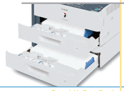
Expandable Paper Supply