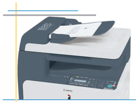
Duplexing Automatic Document Feeder