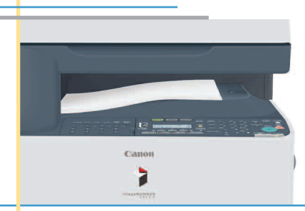
Integrated Output Tray

Plug-and-play connectivity is provided via a standard USB 2.0 Hi-Speed interface for optimal performance. Best of all, each model can be fully networked so you can extend system capabilities to multiple users (optional for the Canon imageRUNNER 1025 model).