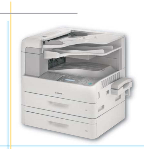
LASER CLASS 830i Shown with Optional 500-Sheet Paper Cassette and Hand Set

The LASER CLASS 800 Series devices come standard with a 500-sheet user-adjustable paper cassette that supports up to legal-sized paper and a 100-sheet multipurpose tray for handling various media types. Add an additional 500-sheet paper cassette to boost total capacity to up to 1,100 sheets.