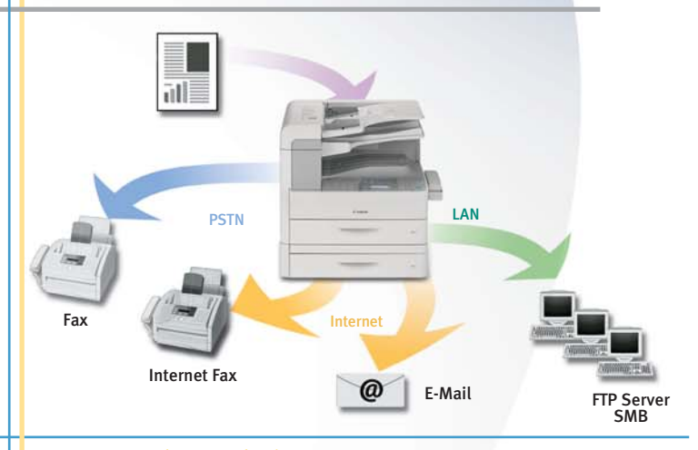
Document Distribution Technology

These powerful features aid in eliminating the burden of manually copying or storing inbound and outbound communications for retention purposes, as well as helping to meet the requirements of specific security regulations.