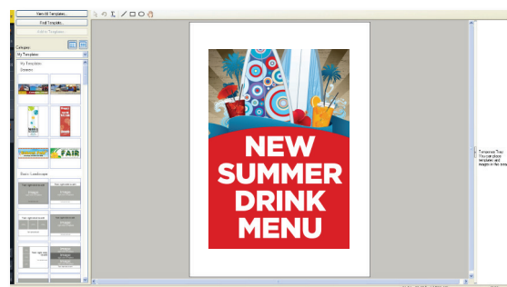
PosterArtist poster creation software