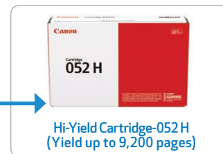
Hi-Yield Cartridge-052 H (Yield up to 9,200 pages)

Use of Canon GENUINE toner cartridges helps provide longer equipment life, high yields, reliable performance, high-quality output, and minimal jamming or issues.