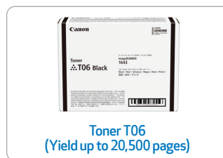
Toner T06 (Yield up to 20,500 pages)

Use of Canon GENUINE toner cartridges helps provide longer equipment life, high yields, reliable performance, high-quality output, and minimal jamming or issues.