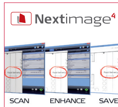
Awarded Nextimage software to ensure image quality for both archival and printing