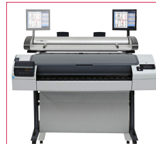
A good ergonomic environment for left- as well as right-handed operation

Contex Head Office Phone: +45 4814 1122 info@contex.com