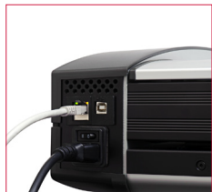
Copy to unlimited number of printers via network or USB