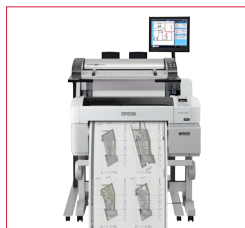
IQ Quattro 24 MFP Repro