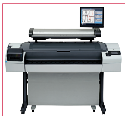
SD 36 MFP Repro

A Contex MFP Repro bundle includes a scanner, intuitive Nextimage REPRO software for scanning and copying, and a high stand. Also available with low stand for side-by-side solutions.