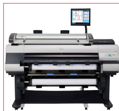
IQ Quattro 44 MFP Repro