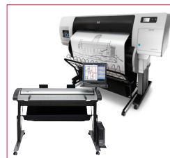
Low stand version available for side-by-side