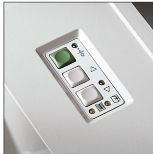
The electronic control panel allows for auto on/off, continuous run, and reverse operation.