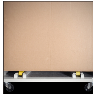
Conveyor of rollers on each side allows for easy removal of the 50 gallon waste container.