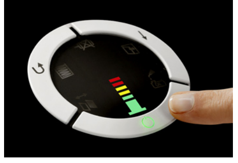
The easy-to-use command dial controls all of the shredder's functions and illuminates the proximity to sheet capacity.