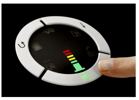
The easy-to-use command dial controls all of the shredder's functions and illuminates the proximity to sheet capacity.