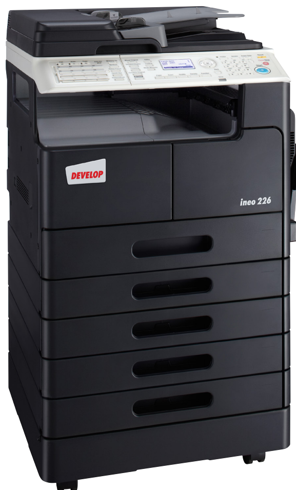
ineo 226 with duplex document feeder (DF-625), fax functionality, duplex unit (AD-509), additional paper trays (PF-507) and stand (DK-708)

Users are often overstrained when using modern multifunctional office devices. Here, too, the ineo 226 is a pleasant exception because it has been specifically designed for ease of operation. A simple-to-use display menu guides users through all the system's functions so they can see at a glance what they need to do.