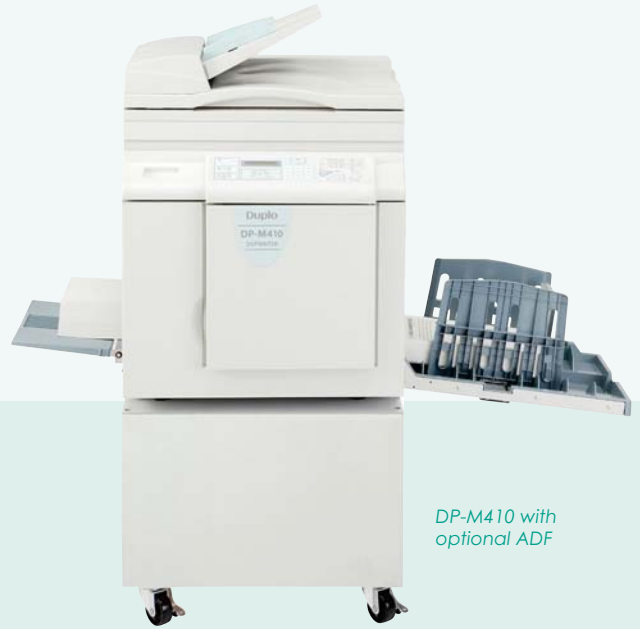
DP-M410 with optional ADF

The DP-M310/410 is no different than a copier when it comes to ease of use. From programming a job on the control panel to replacing ink cartridges and master rolls, the digital duplicator's simple design makes it easy for anyone to operate. Clean and easy master removal is also made possible via a patented automatic master disposal