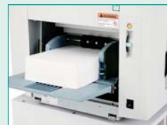
High Capacity Feeder