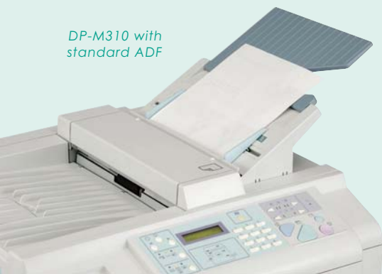
DP-M310 with standard ADF

Spot colors can be added to your documents just by changing the color drum. Multiple colors are available and Duplo can customize any Pantone color by request.