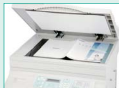
Platen Top Scanner (DP-M410)