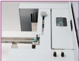
Unique air-suction feeder for reliable feeding