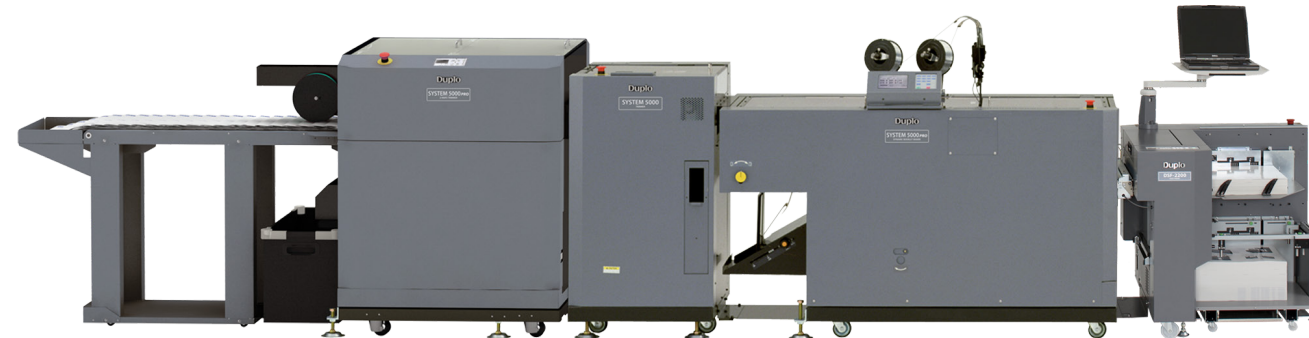
500 Digital Booklet System | DSF-2200 with DBM-500/T + DKT-200 |