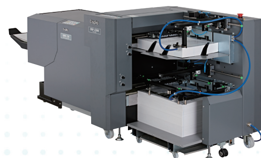
150 Digital Booklet System | DSF-2200 with DBM-150 with SxS Kit/DBM-150T |

The 150 Digital Booklet System is Duplo's entry-level sheet feeding system connecting the DSF-2200 with the DBM-150 Bookletmaker equipped with the DBM-150SxS Kit. Featuring the Isaberg Rapid stapler and staple cartridge, the DBM-150 Bookletmaker produces a high quality, flat staple every time. Each cartridge holds 5,000 staples and wear parts are replaced each time the cartridge is changed out, providing a high level of reliability. The DBM-150 Bookletmaker can be operated via the control panel where up to 16 jobs can be saved in memory or via a PC using the optional PC Controller. Compact in size yet built-in with high performance features, the 150 Digital Booklet System produces superior corner, side, or saddle-stapled applications up to 1,720 booklets per hour.