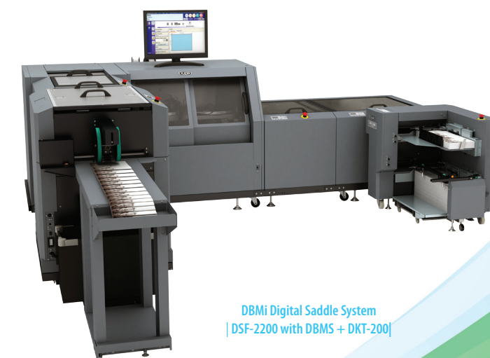
DBMi Digital Saddle System | DSF-2200 with DBMS + DKT-200 |