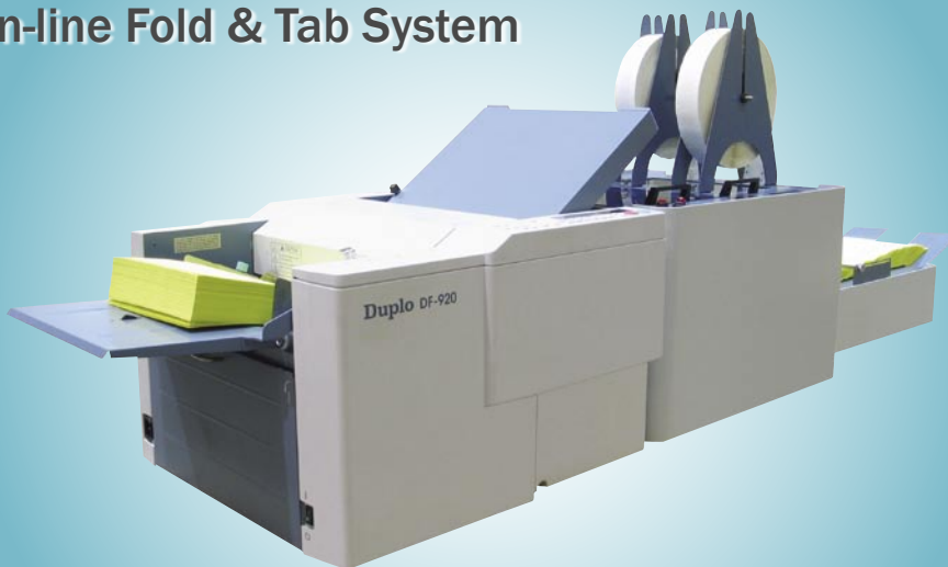
Duplo DF-920 FOLDER In-line with DT-900 TABBER