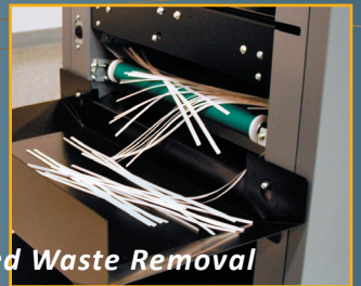
Automated Waste Removal

H I G H L Y P R O D U C T I V E , A F F O R D A B L E F I N I S H I N G