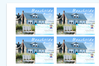
4-up Postcards on 12" x 18" with L-Shape Perforated Business Cards