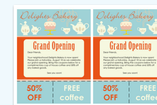
2-up Flyers on 12" x 18" with T-shape Perforated Cards