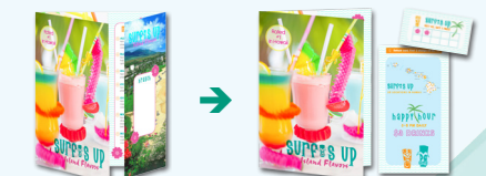
fold with IFS in one pass