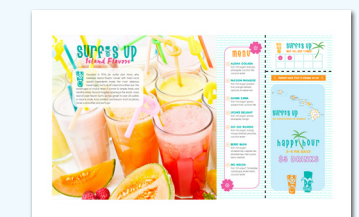
1-up Flyer on 12" x 18" with One Fold and T-shape Perforated Cards