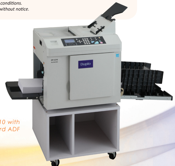
DP-G210 with standard ADF

Production rates are based on optimal operating conditions and may vary depending on stock and environmental conditions. As part of our continuous product improvement program, specifications or cabinet designs are subject to change without notice.