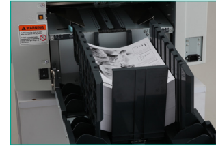
Improved Stacking Performance The U-shaped receiving tray stacks the prints neatly.