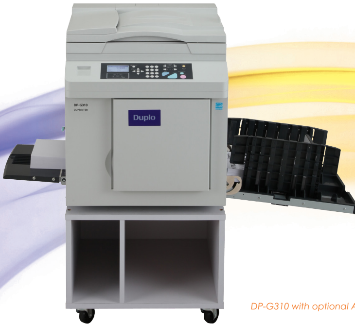
DP-G310 with optional ADF

Duplo's Affordable, Feature-Rich Digital Duplicator