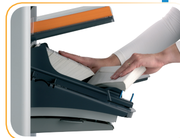
Optional Production Feeder