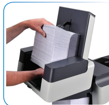
High-Capacity Vertical Output Stacker