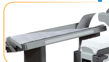
Optional High-Capacity Envelope Hopper and Output Conveyor - Each can hold up to 1,000 envelopes

Formax - New Hampshire, USA www.formax.com