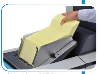
Optional Insert/BRE Feeder