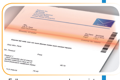
Full-page scanner reads a variety of codes, anywhere on the page