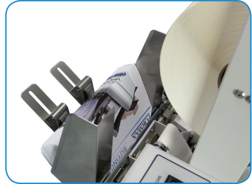
Integrated bottom feed for continuous operation

The Formax FD 262 Single-Head Tabber makes quick work of applying tabs to folded mailpieces, and is designed to meet all USPS requirements for mailing and automation discounts. Using “crash tab” technology, the open edge of a mailpiece contacts an adhesive tab and travels through a set of rollers where the tab is tightly folded and sealed, creating a mail-ready piece.