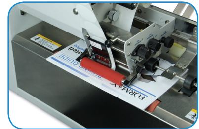
Applicator and rollers ensure tab is tightly folded and sealed