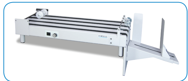
FD 282-30 Drop-Stacking Conveyor

Formax - New Hampshire, USA www.formax.com