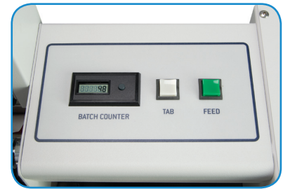
Simple, push-button controls and resettable LCD counter