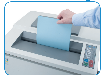
Standard Infeed accommodates up to 24 sheets at once

Formax – New Hampshire, USA www.formax.com