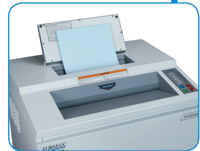
Dedicated AutoFeeder holds up to 175 sheets