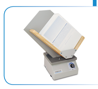
402 Series Jogger - an option which reduces static electricity from forms and aligns them for proper feeding