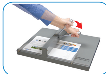
Press down with creasing handle