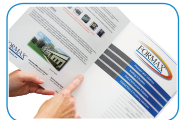
Sheet is creased and ready for crack-free folding

Formax - New Hampshire, USA www.formax.com