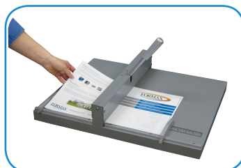
Load sheet to be creased