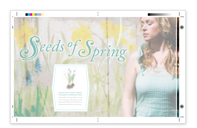
Oversize Output for 297 x 432 bleed

Depending on your needs and budget, you can go with the all-in-one Professional Finisher and get stacking, stapling, hole punching, booklet making and v-folding; or start with the Office Finisher LX and get stacking and stapling with the flexibility to add separate hole punching, creasing and stapling capabilities as your workload dictates.