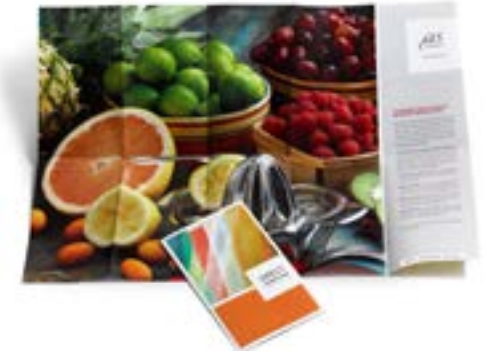
Direct mail. Large-sized poster pieces