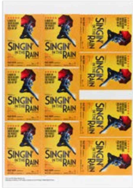
Imposition efficiency. Print 5.83 x 8.27 inch event flyers 10 up on a 29 inch sheet.