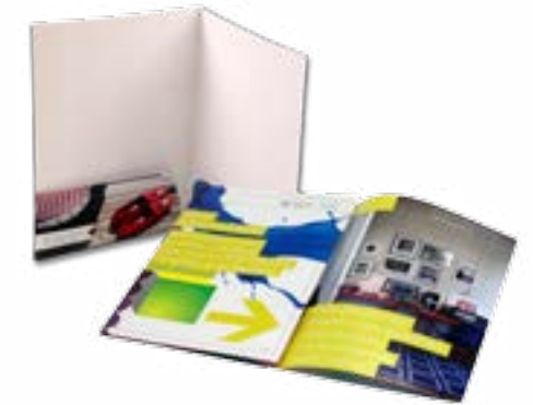
New marketing collateral possibilities. Pocket folders and 6-page folded brochures.

Automated consumable replacement. The Photo Imaging Plate (PIP) is changed by an automated system freeing operators to do other tasks and increasing press uptime.