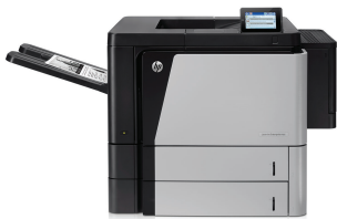
HP LaserJet Enterprise M806dn Printer

This HP LaserJet handles big print jobs fast, with extra-large input capacity and versatile paper-handling options. Mobile printing is simple with wireless direct printing and touch-to-print technology. Easy upgrades protect your investment. 1,2