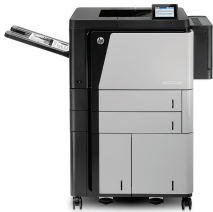
HP LaserJet Enterprise M806x+ Printer