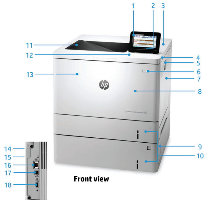
Close-up of I/O ports