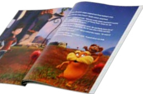
Produce high-coverage publishing applications.

High print permanence. An independent testing institute, Wilhelm Imaging Research, has verified the permanence of HP Indigo photobook prints. A WIR dark permanence rating of more than 200 years for HP Indigo prints ensures excellent long-term stability and freedom from gradual yellowing when stored in albums and other dark locations. The display quality of HP Indigo prints was also confirmed in WIR testing.