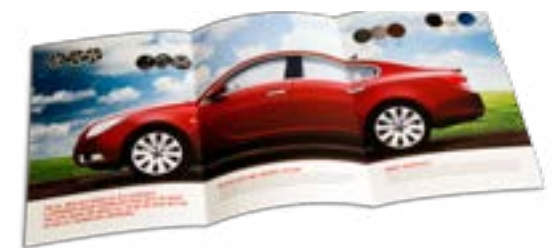
High productivity for large-sized marketing collateral.

PrintOS. Print Beat provides visibility to press performance to drive continuous improvement to print operations. PrintOS Site Flow efficiently manages any number of jobs per day, even hundreds or thousands. Automate, simplify and streamline files submission with PrintOS Box. Use PrintOS Composer for heavy VDP processing including sophisticated HP SmartStream Mosaic campaigns.