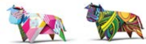
HP SmartStream Mosaic one-of-a-kind designs.