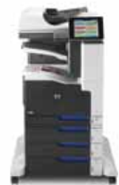
(HP LaserJet Enterprise 700 Printer M775z)