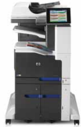
(HP LaserJet Enterprise 700 Printer M775z+)

Mobile printing capability: 3 HP ePrint, Apple AirPrint™