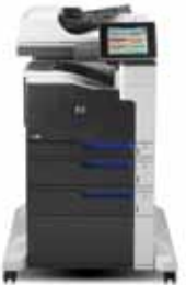
(HP LaserJet Enterprise 700 Printer M775f)