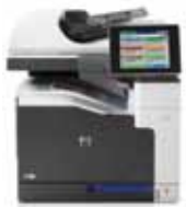
(HP LaserJet Enterprise 700 Printer M775dn)