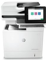
HP LaserJet Enterprise Flow MFP M631h

This HP LaserJet MFP with JetIntelligence combines exceptional performance and energy efficiency with professional-quality documents right when you need them—all while protecting your network from attacks with the industry's deepest security. 1