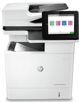
HP LaserJet Enterprise MFP M633fh

This HP LaserJet MFP with JetIntelligence combines exceptional performance and energy efficiency with professional-quality documents right when you need them—all while protecting your network from attacks with the industry's deepest security. 1