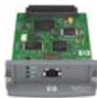
HP Jetdirect internal print server

Print professional documents and save time with the automatic two-sided printing unit (standard on the 5200dtn model).