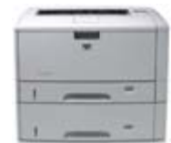
HP LaserJet 5200dtn printer