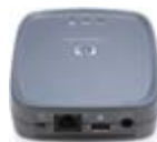
HP Jetdirect wireless external print server

Increase efficiency and security by installing the HP Jetdirect 635n IPv6/IPsec and Gigabit Ethernet internal print server in the available EIO slot.