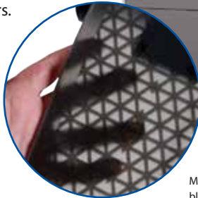
Multi-material prototypes can blend clear, black and white to communicate ideas and simulate finished products