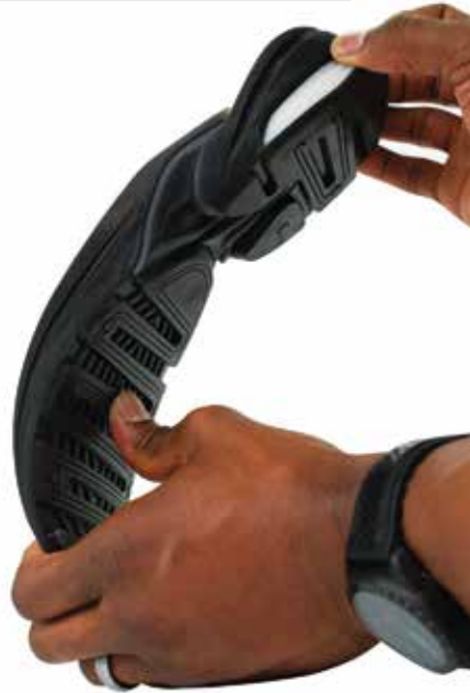
Shoe sole printed in a combination of flexible black elastomer and rigid white plastic

MJP offers exceptional resolution with layer thicknesses as low as 13 microns. Selectable print modes let you choose the best combination of resolution and print speed, so it's easy to find a combination that meets your needs. Parts have smooth finish and can achieve accuracies approaching SLA precision for many applications.