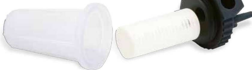
Functional filter prototype printed in clear, white and black rigid plastics