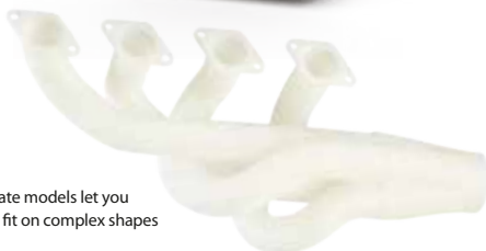
Accurate models let you check fit on complex shapes