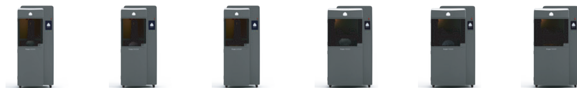
ProJet 6000 SD ProJet 6000 HD ProJet 6000 MP ProJet 7000 SD ProJet 7000 HD ProJet 7000 MP

Extend Innovation. Extend Production. Extend Choices.