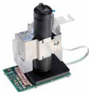
HP Optical Media Advance Sensor (OMAS)

Turn orders in record time with the fastest 60-inch production printer for graphics. 6 Offer exceptional color and black-and-white prints on many substrates with 8 HP Vivid Photo Inks. Count on advanced color management features backed by HP reliability and easy operation.