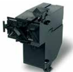
Spectrophotometer with i1 color technology from X-Rite