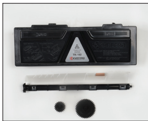
KYOCERA toner container including just five components and two materials

Environmentally friendly and highly economical, ECOSYS MFPs leverage KYOCERA's advanced technology to deliver all the powerful functions users demand packed within a compact device, enabling you to work faster and smarter. Incorporating a durable imaging system based on KYOCERA's long-life patented drums, these MFPs are capable of printing thousands of pages over time before requiring parts replacement. Because the drum is separate from the toner, only the toner needs to be replaced when depleted. Not only does this reduce waste, it provides your business with an economical advantage.