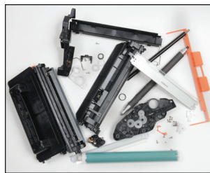
Traditional laser printer cartridge containing many components, comprising various materials