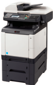
FS-C2626MFP shown fully configured for optimal performance