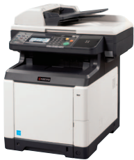
FS-C2626MFP standard configuration