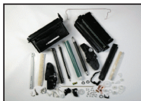
Traditional laser printer cartridge containing many components, comprising various materials