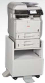
Standard Tray with one 500 Sheet Tray