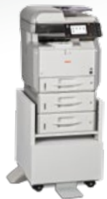
Standard Tray with two 500 Sheet Trays