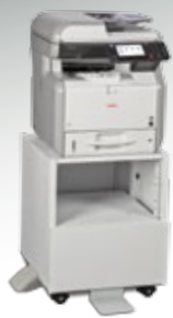
Standard 500 Sheet Tray