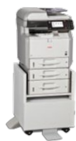
Standard Tray with one 250 and one 500 Sheet Tray