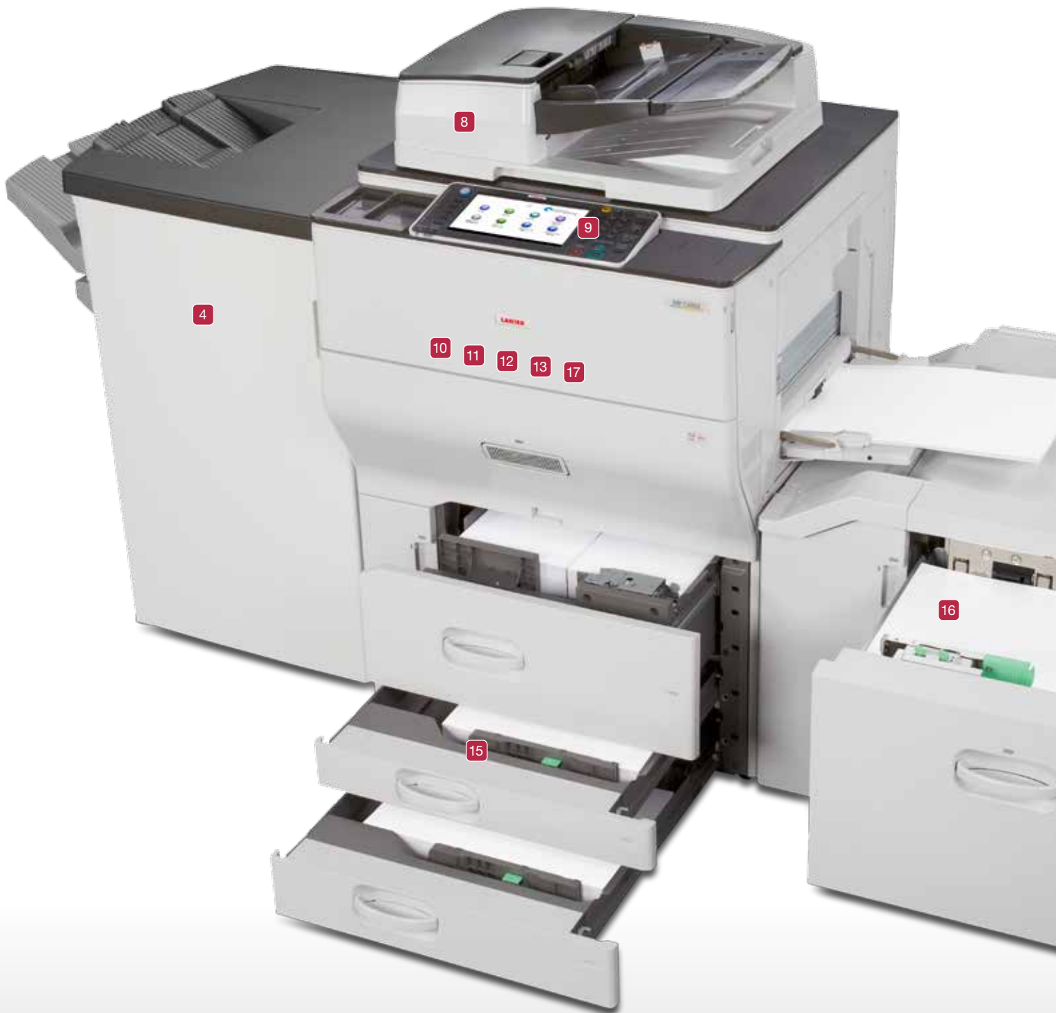
Lanier MP C6502/MP C8002