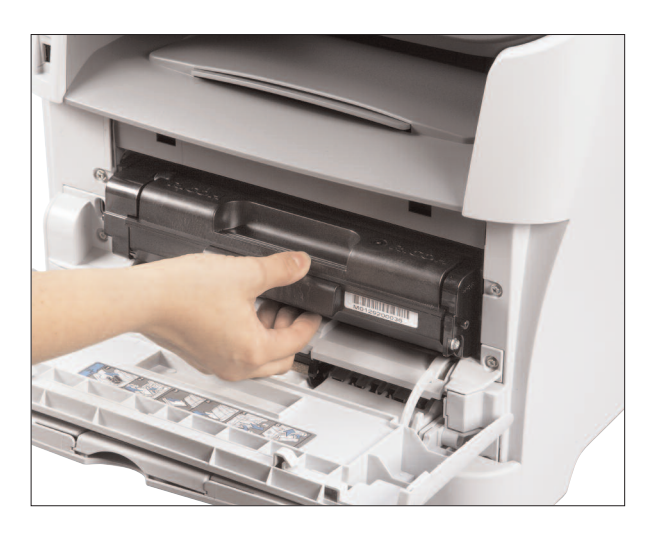
The All-in-One Cartridges are not only easy to replace, they feature a less expensive, lower-yield choice and a higher-yield option with a lower cost-per-page.

Copy two-sided documents onto the same side of a single sheet with the ID Copy feature. For convenient duplicating of auto driver licenses, insurance cards, checks, etc., simply copy the first side, flip the original over and copy the second side.