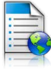
Forms and Favorites

Display Customization: Display a customized, scrolling slideshow on the color touch screen to communicate important messages to users while the printer is in Power Saver mode.