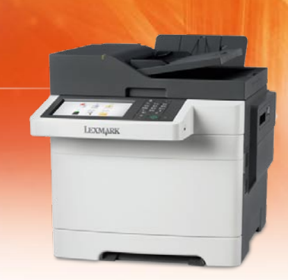
Up to 32 ppm