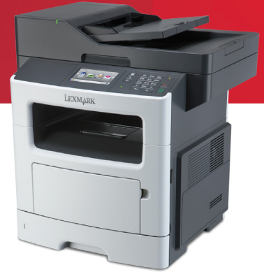
MX510de / MX511de/dhe